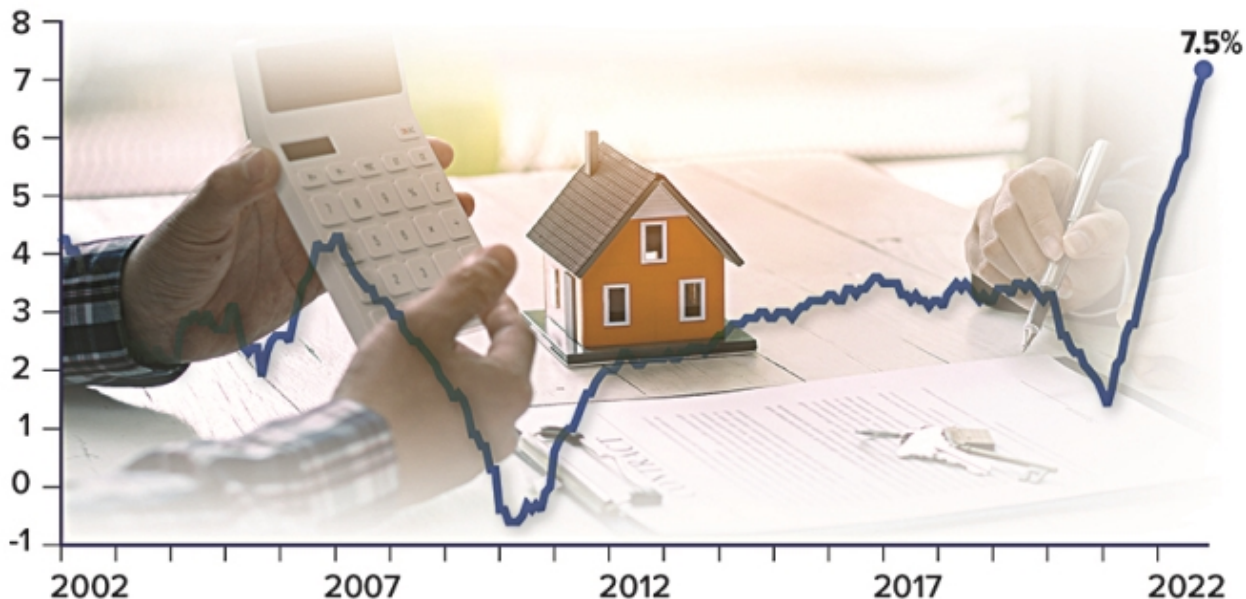
12-month change in shelter costs (CPI-U)